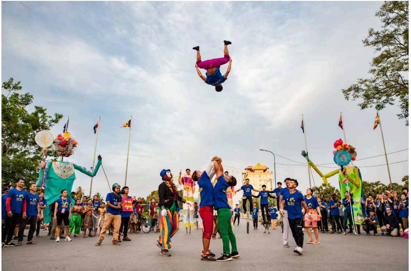
Circus performances at the 11th Tini Tinou International Circus Festival in 2021. Phare Ponleu Selpak