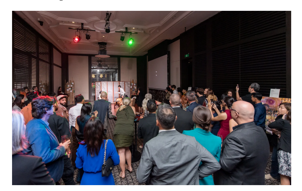
This year's charity dinner delivered an evening of extraordinary experiences, showcasing Cambodia's rich culture and abundant talent. Guests were

Phare Ponleu Selpak, meaning "The Brightness of the Arts" in Khmer, is a beacon of hope and creativity in Cambodia. Established in 1994 by nine survivors of the Khmer Rouge regime, Phare Ponleu Selpak has grown into a respected grassroots arts and vocational training center in Battambang. While the school is celebrated for its captivating circus performances, it also provides free public education, art lessons, vocational training, and more to over 1,200 eager students.