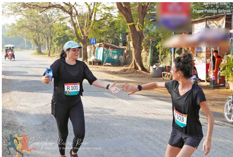
Participants encourage each other at the Sangke River Run in January.

The Sangke River Run, held in Battambang to raise funds for – a well-known circus and arts school based in the province – has been celebrated as a success by organisers.