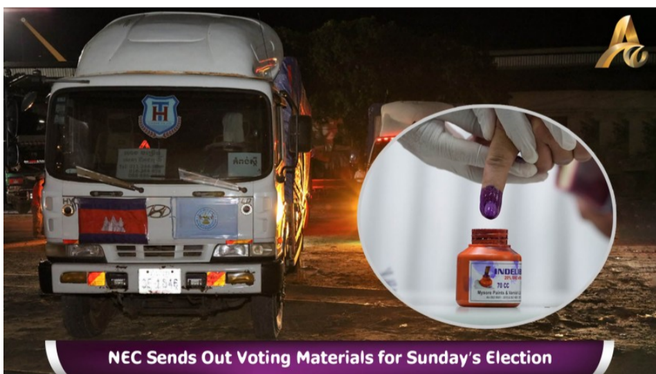
NEC Sends Out Voting Materials for Sunday's Election