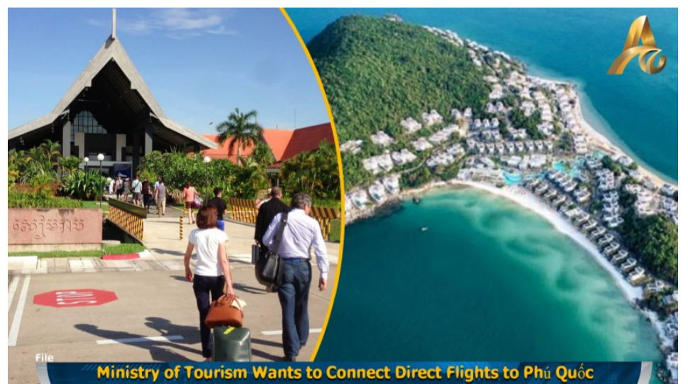
Ministry of Tourism Wants to Connect Direct Flights to Phú Quốc

NEC Sends Out Voting Materials for Sunday's Election