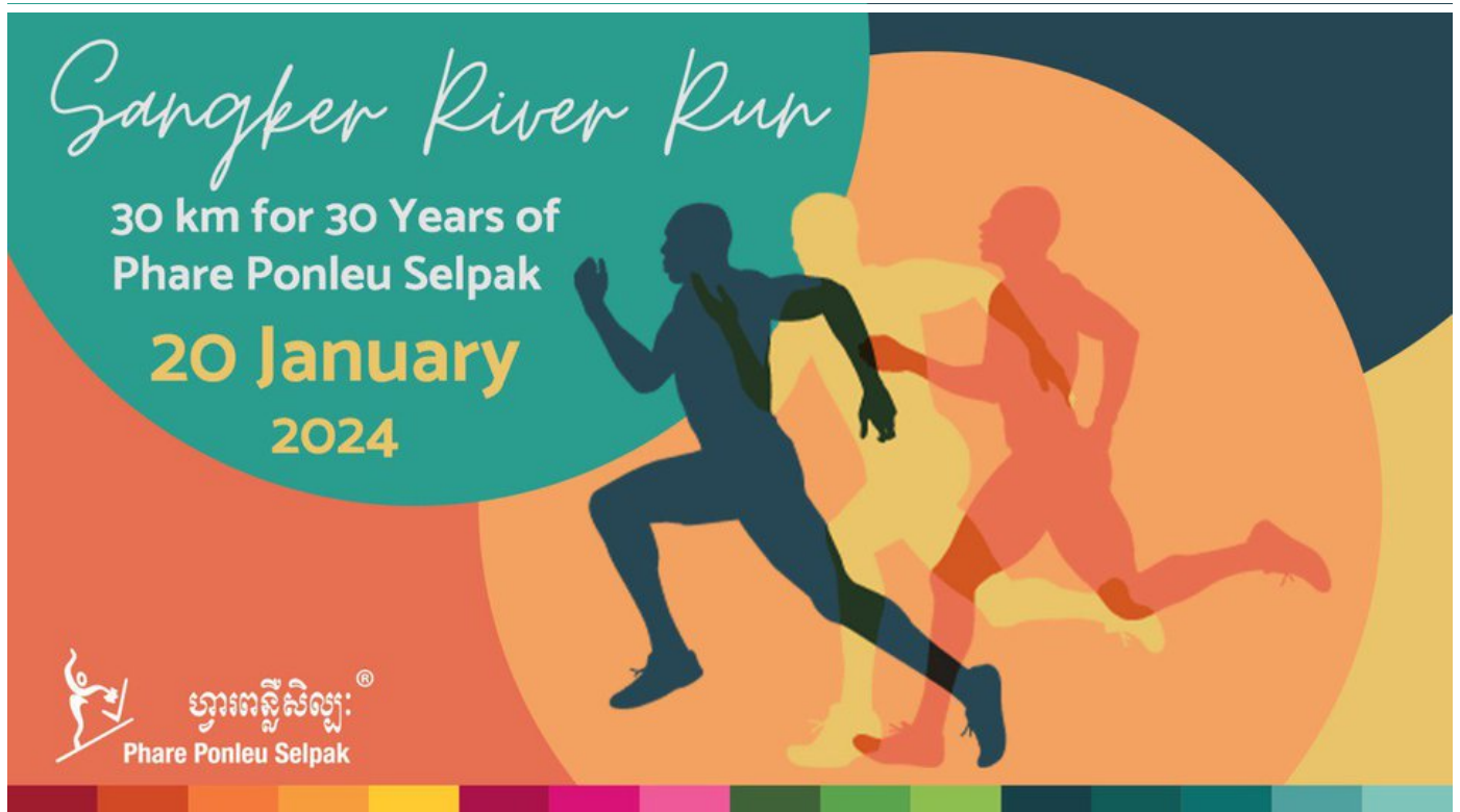
The 30km Sanger River Run poster.