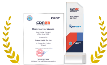
Award-winning Kiripost: Leading the way in digital content, 2023.