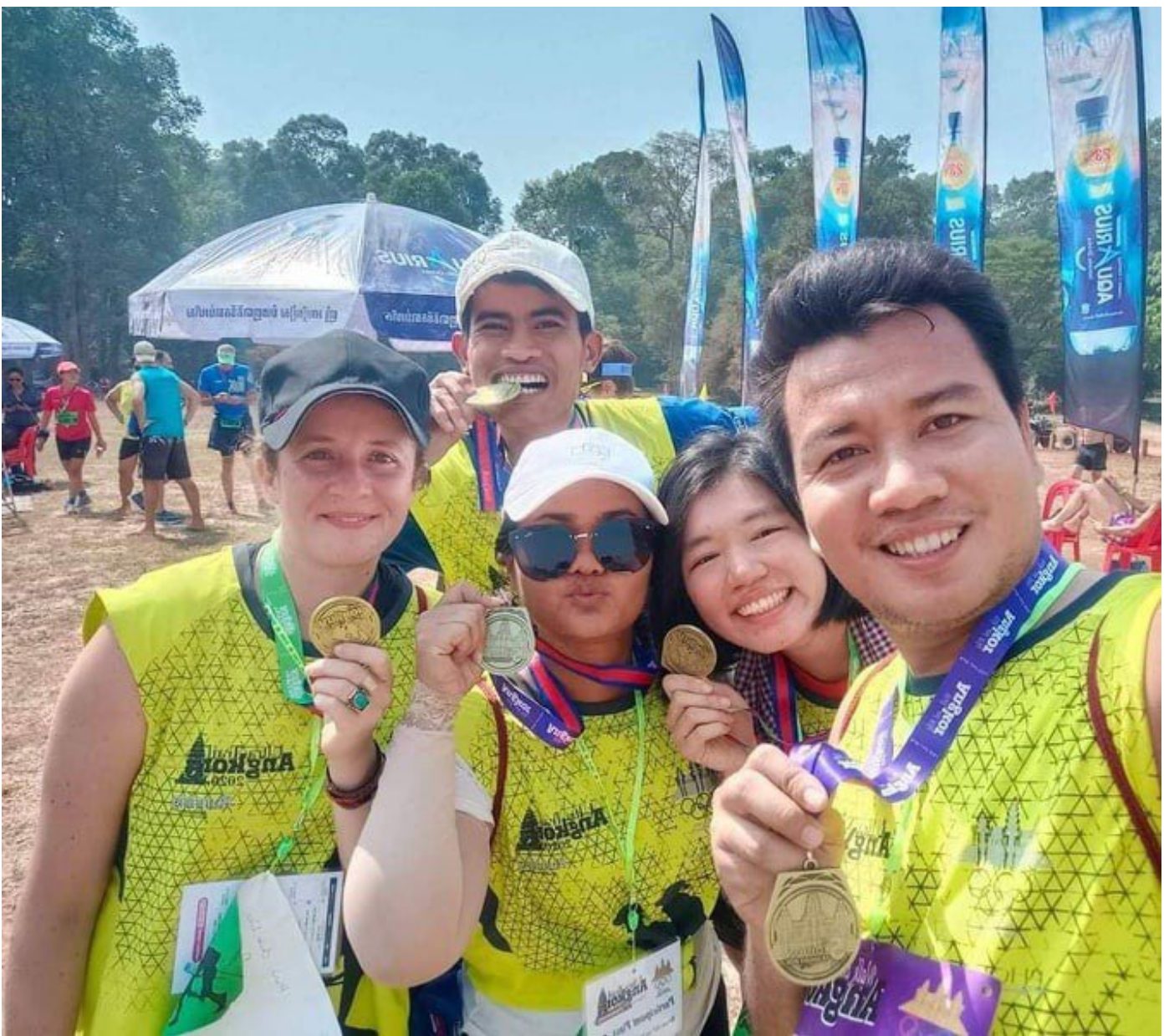
Victorious runners in previous event.

From there, the route winds along the Sangker River past rice fields, over suspension bridges, and through downtown Battambang, a UNESCO Creative City. Participants will finish the race at Phare Ponleu Selpak's campus.