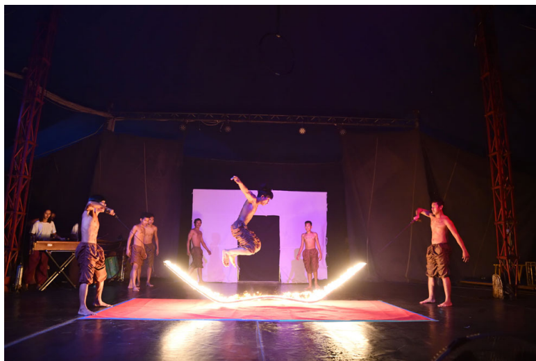
A fiery performance by Battambang's Phare Ponleu Selpak in recent past. PHARE PONLEU SELPAK

Approaching its 30th anniversary, PPS is gearing up for the Sangke River Run, a pioneering long-distance running and cycling event along the Sangke River in Battambang, scheduled for January 20, 2024. This 30-km challenge not only tests endurance but also provides a unique opportunity for athletes.