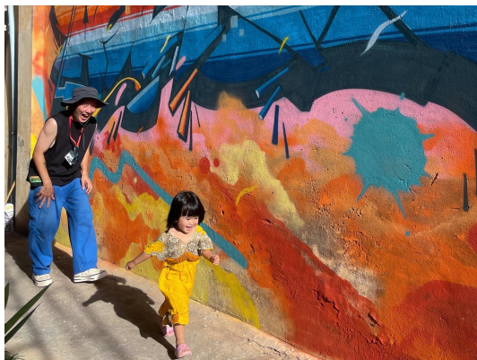
Aserk interacted with locals.

The non-profit Phare Ponleu Selpak was established in 1994 and focuses on educating Cambodians about their indigenous arts and cultures. It is today Cambodia's largest center for nurturing artistic and cultural talent, and its Phare the Cambodian Circus is even more well-known outside. Phare Ponleu Selpak has made it a priority throughout the years to educate people across the world about Cambodian history, culture, and art.