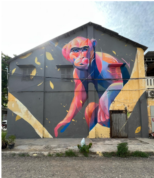
Taiwanese artists participated 2023 S'art Urban Art Festival for mural creation.