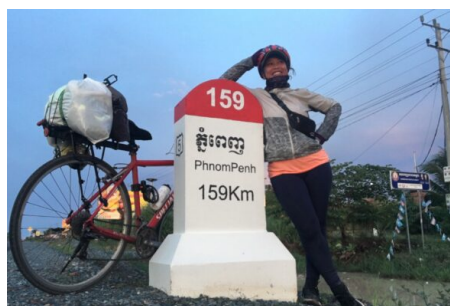
Life's Journey: A Bike Ride Around Tonle Sap Lake