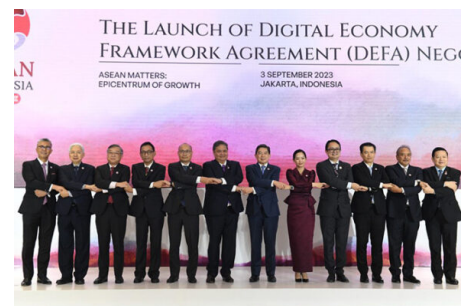
ASEAN Takes a Stride Towards a Regional Digital Economy with DEFA Negotiations